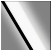
Polished Stainless Steel - PSS

Digital: Not all screens are calibrated the same, and therefore, colors will appear differently between screens.